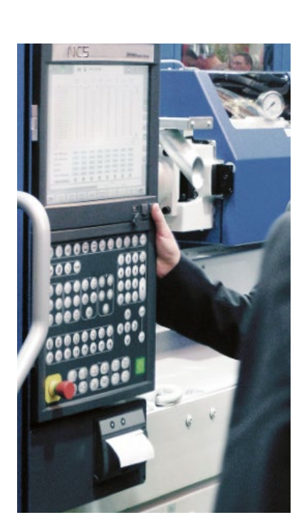
The GeBE-MULDE Maxi offers great versatility paired with individual design customization.

Service IONM /Technical Service Specialist IONM Dr. Langer Medical GmbH