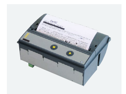
Integrated DC/DC modifier allows the to resist voltage peaks. This ensures full flexibility with power supply.