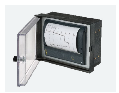
The GeBE MULDE Maxi is available with a DIN normed cover offering dust and splash water resistance (IP54).