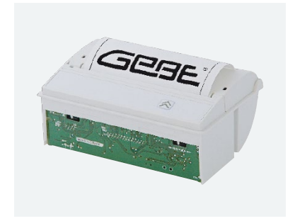
Customization in housing as well as in design foil available starting with small production series.

An energy saving power management guarantees maximum endurance. If nothing is printed the Power Down Mode with a power consumption of almost 0 mA can be activated. A single roll of paper represents 20 m of printing. The GeBE-MULDE-Maxi prints text, graphics or bar code with a resolution of 203 dpi – on standard paper as well as on self-adhesive labels.