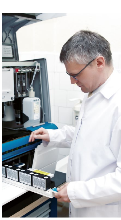
Reliable where it counts. Everything important shown pin-sharp on handy paper format.